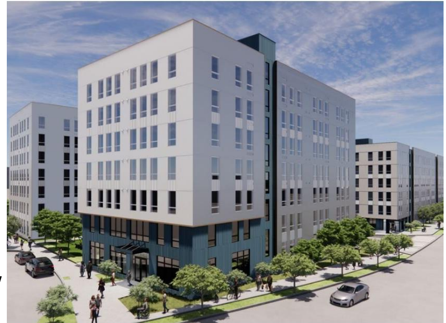
Bridge Housing project at OMFE