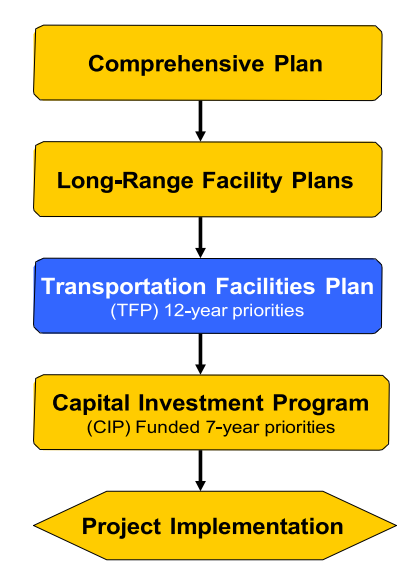
Figure A: Transportation Planning Process

◆ Comprehensive Plan/Long-range transportation facility plans. The City's Comprehensive Plan outlines Bellevue's long-term (20+ years) land use and transportation visions. Long-range transportation plans are prepared for various subareas of the City or for specific components of the transportation system. These plans include a wide range of improvement projects designed to meet the mobility goals of the plan area. Examples are the Bel-Red Plan (adopted 2009), the Eastgate I-90 Land Use & Transportation Project study (completed in 2012) Pedestrian and Bicycle Transportation Plan (update adopted 2009), and the Bellevue Transit Plan (update adopted in 2014). Key projects from these