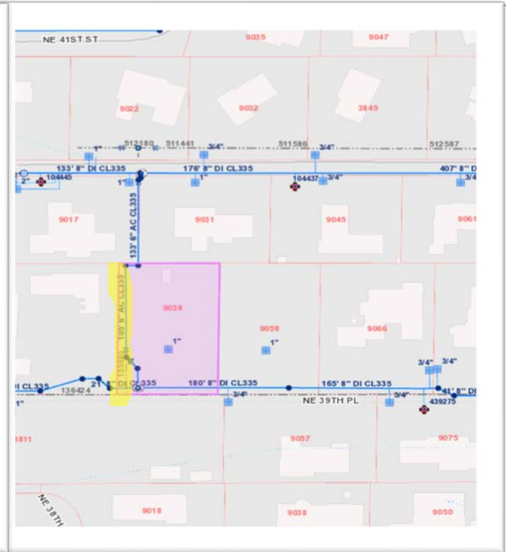
Figure 2. Water Main Map

Property: 9038 NE 39 th Place, Yarrow Point