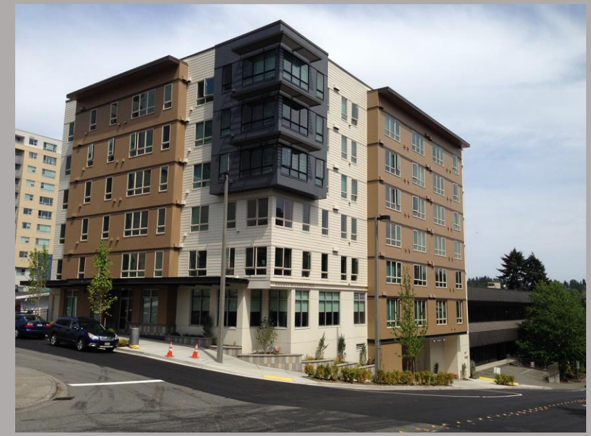
August Wilson Place, LIHI - 57 low-income units