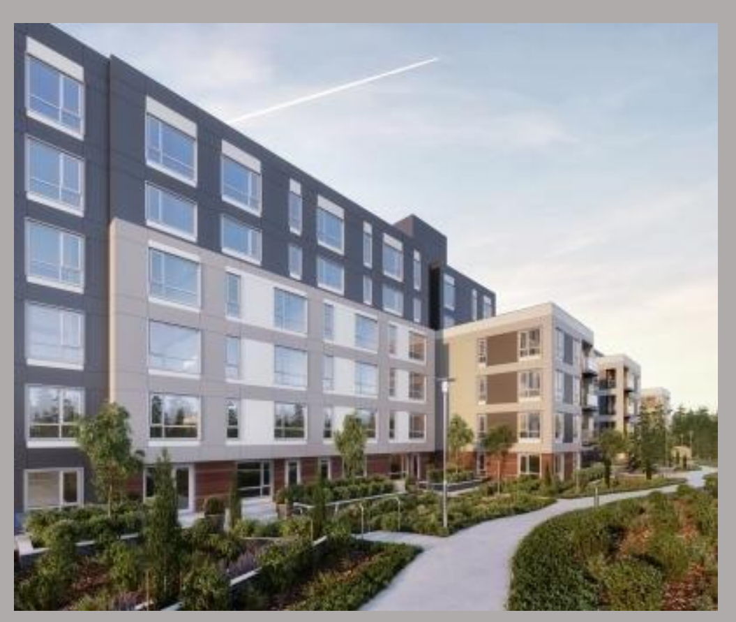
Hyde Square, BelRed FAR 35 affordable units