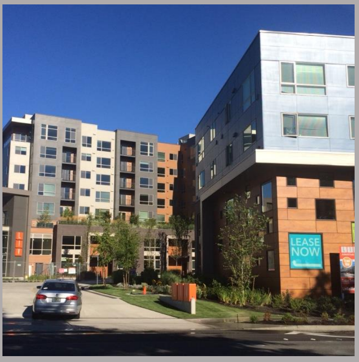
LIV, BelRed FAR incentive - 54 affordable units