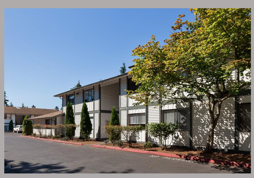
Highland Village, KCHA 76 mod/low income family units

The current work program is on track to achieve its 10-year goal of 2,500 affordable homes.