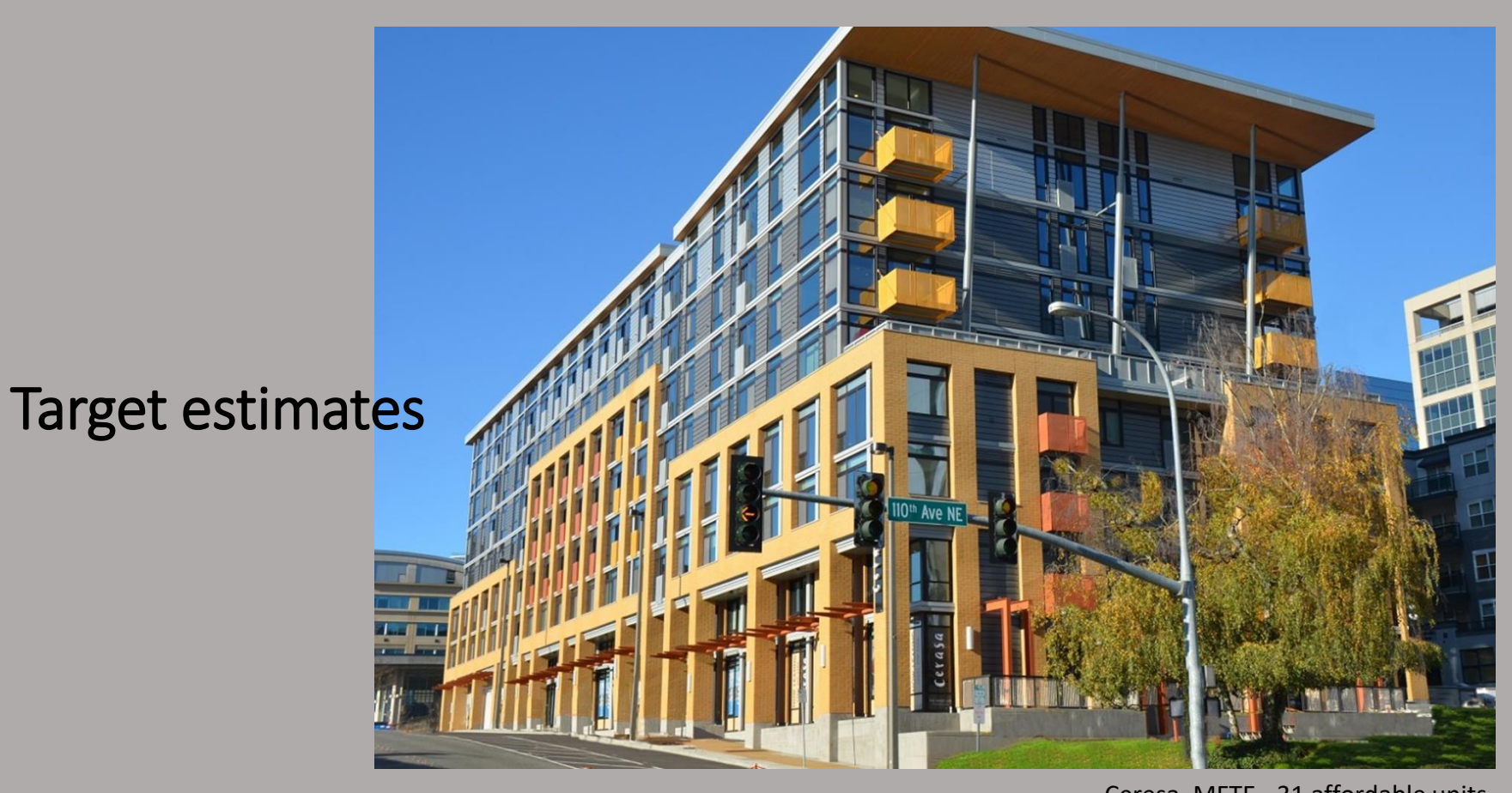
Ceresa, MFTE - 31 affordable units