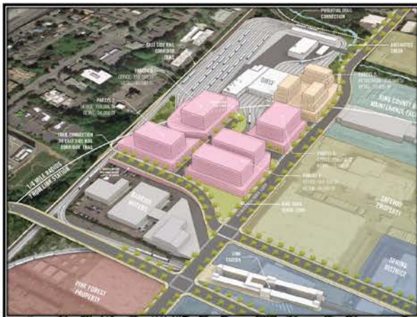
Development concept for TOD around ST maintenance facility