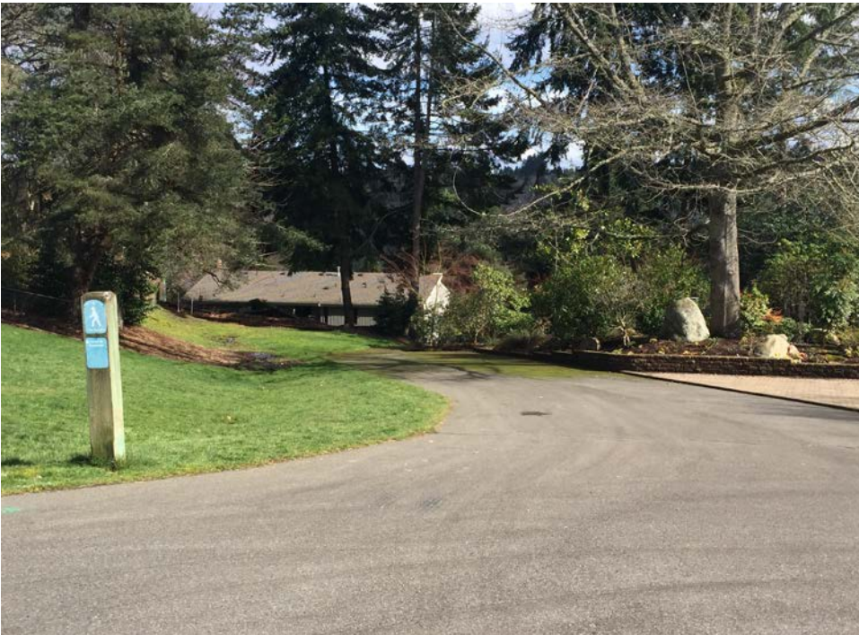
Looking down SE 20 th St from 128 th Ave SE (vacate area on left)