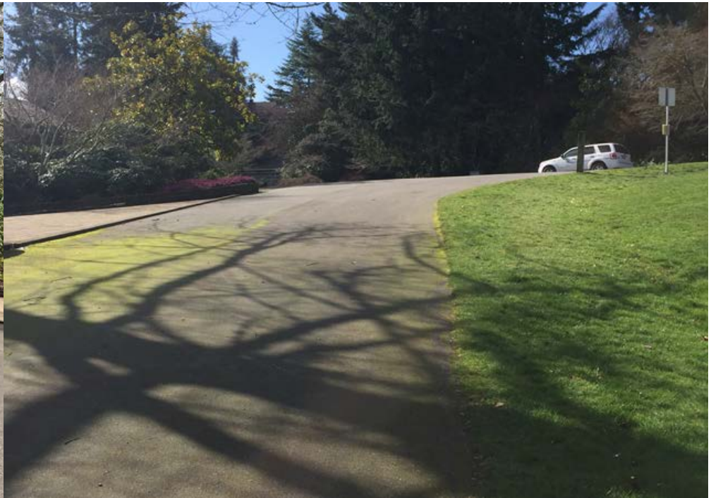
Looking up SE 20 th St at trail (vacate area on right)