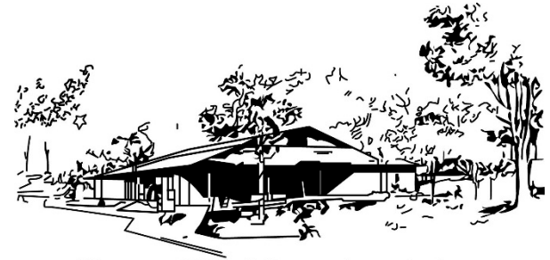
Newport Way Library Association