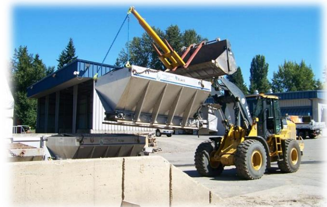
Servicing Plow and Sander Units