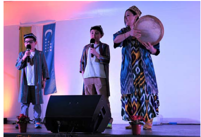
Clockwise from top left: Bellevue Youth Symphony Orchestra Winter Concert, Seattle-Tashkent Sister City Organization Navruz event (2), and Northwest Sound Men's Chorus Sing! Sing! Sing! program.