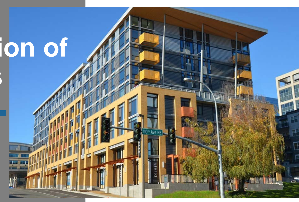
Cerasa, MFTE - 31 affordable units