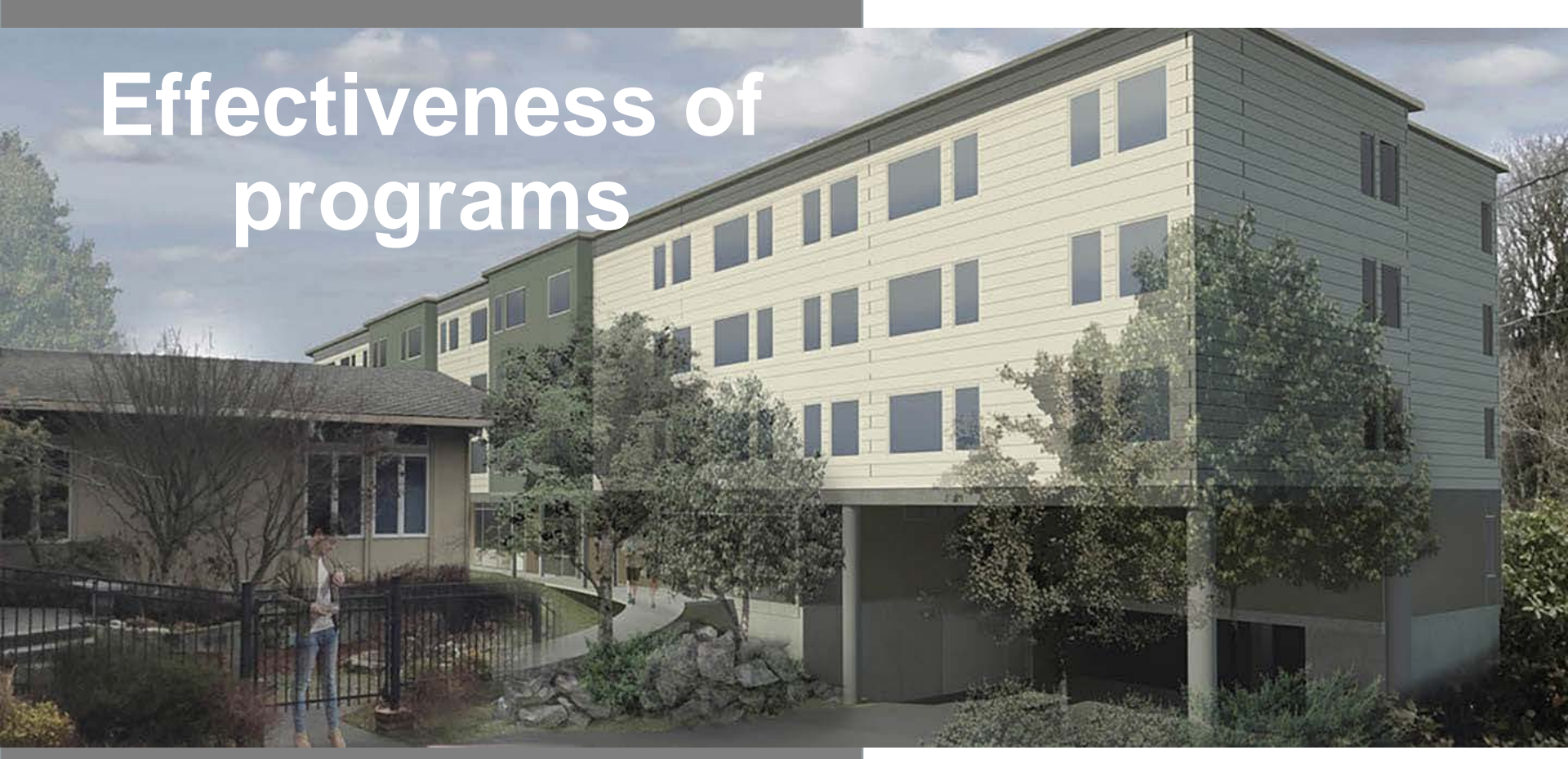
30 Bellevue, Imagine Housing - 62 low-income units