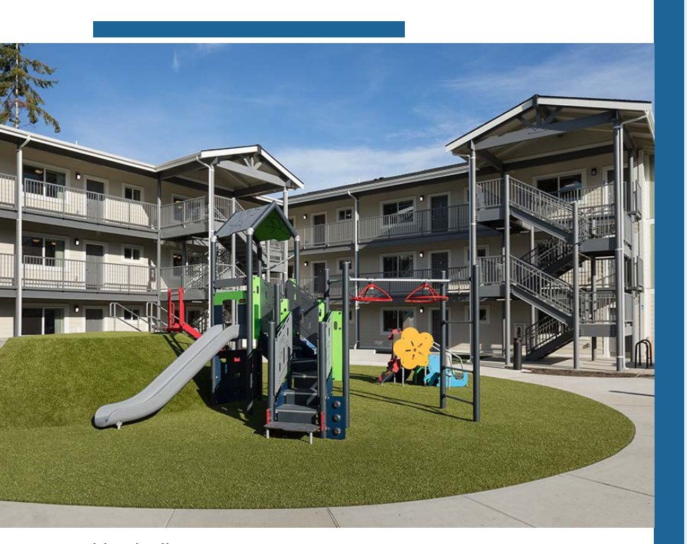
KCHA Highland Village. 100 units Preservation