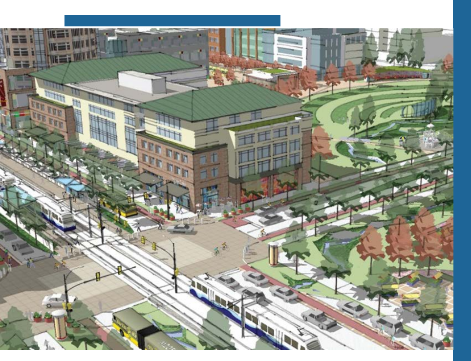
Vision for 130th Station Area