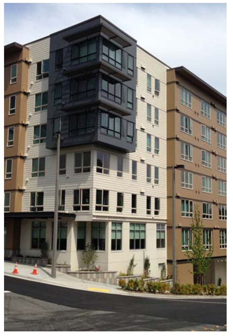
August Wilson Place, LIHI - 57 low-income units