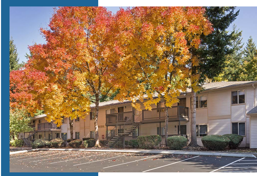
KCHA Kendall Ridge. 240 units Preservation