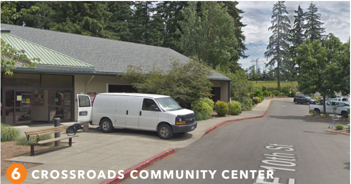
6 CROSSROADS COMMUNITY CENTER