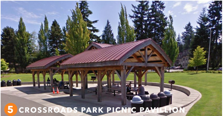
5 CROSSROADS PARK PICNIC PAVILION