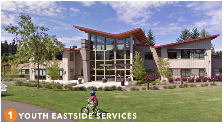
1 YOUTH EASTSIDE SERVICES