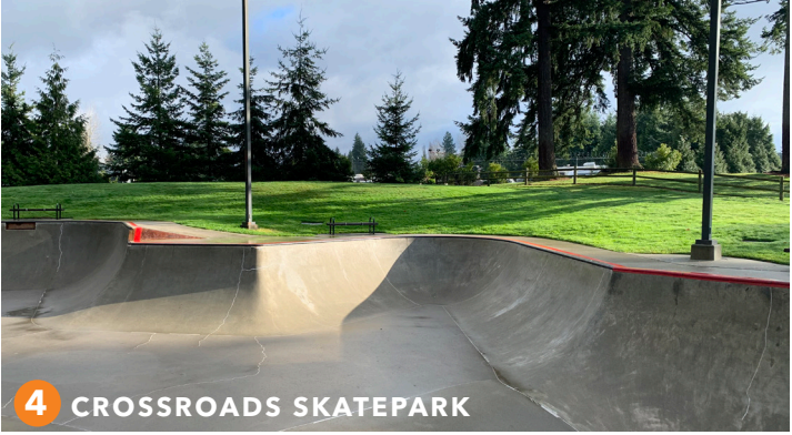
4 CROSSROADS SKATEPARK