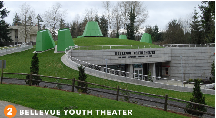
2 BELLEVUE YOUTH THEATER