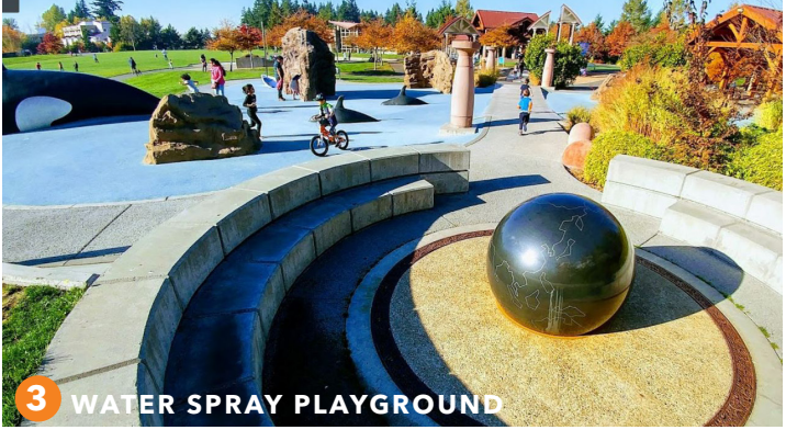
3 WATER SPRAY PLAYGROUND