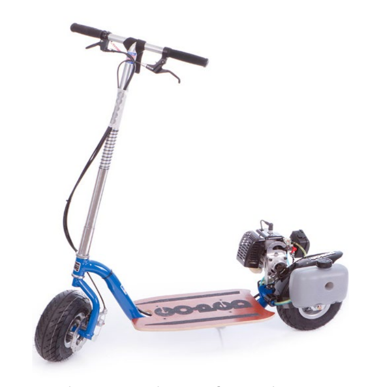
Go-Ped gas-powered scooter from early 2000s