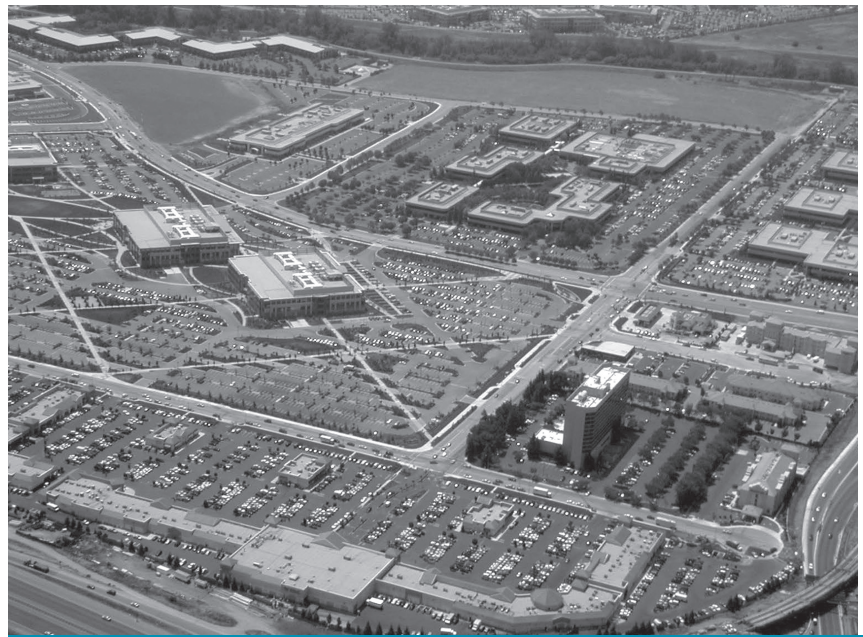
Stuart Cohen, Transform

Drivers pay for their cars, fuel, tires, maintenance, repairs, insurance, and