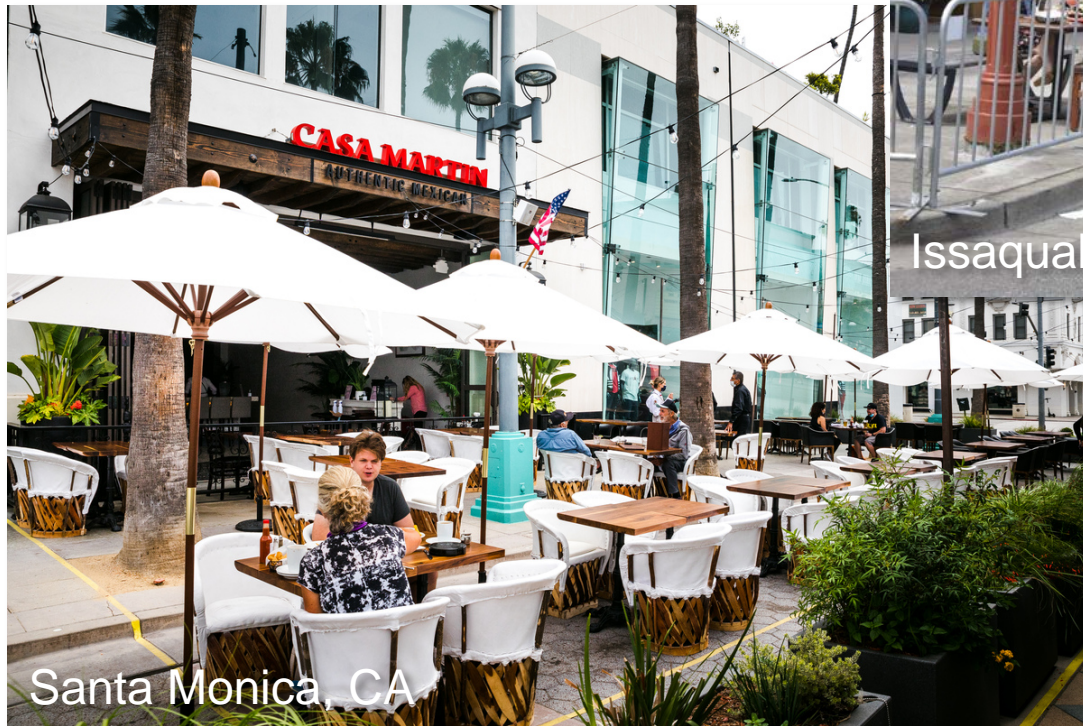
Santa Monica, CA