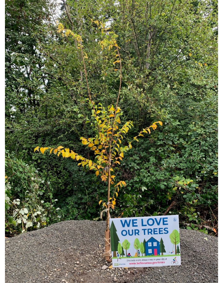
Photo of Accolade Elm from 2021 Tree Giveaway, courtesy of Annie Craig.