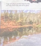
Large and small rocks make the bed of the stream and the pond.